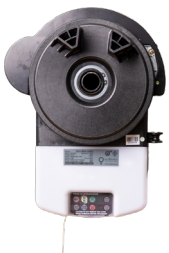
Opener with LED Courtesy Lights