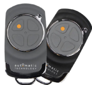
2x TrioCode™128 transmitters